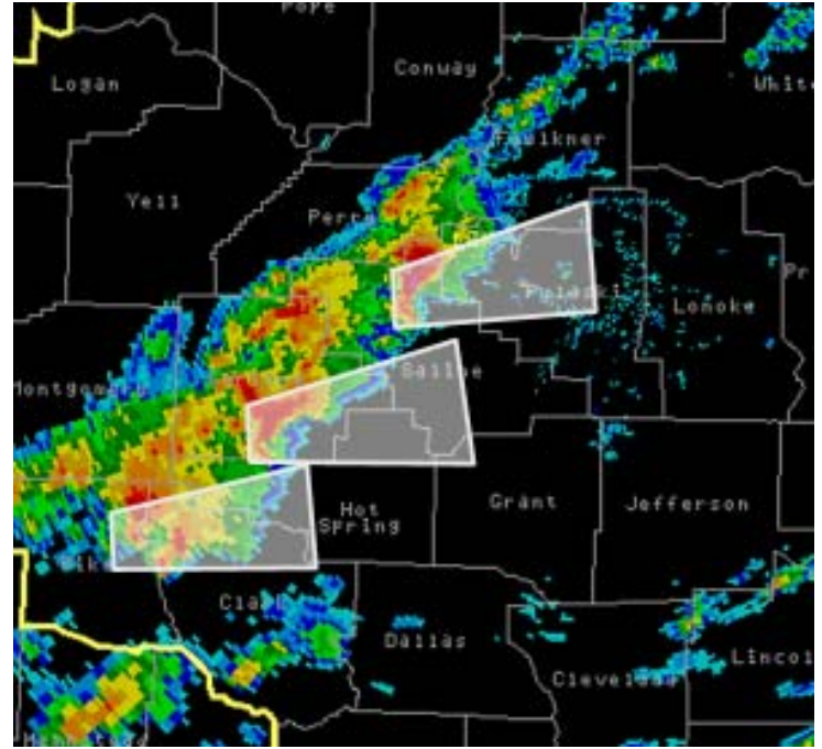
A storm-based warning system (above) is more specific. Here, 70 percent less of an area is covered, and about 600,000 fewer people are needlessly warned.